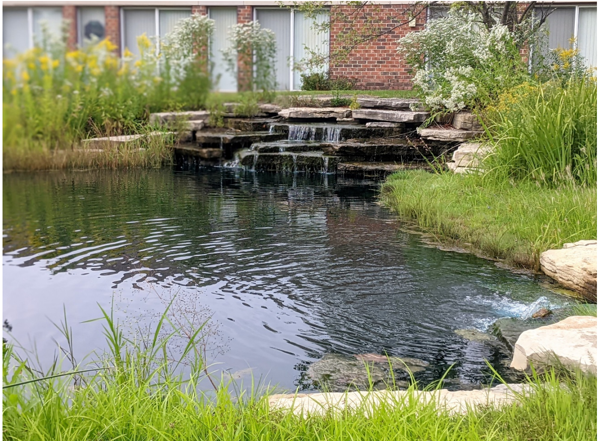
Coromandel pond by Manor homes