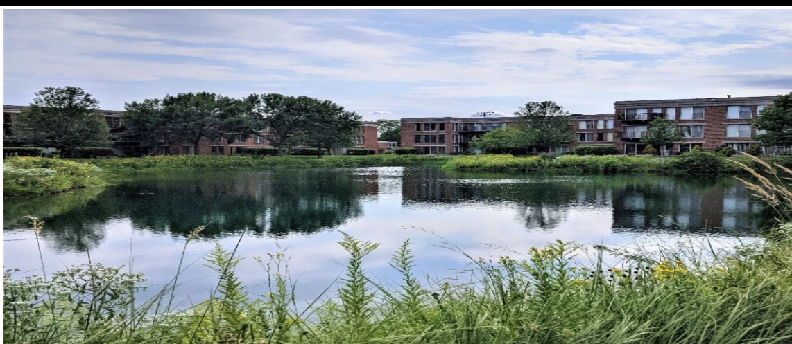
One of the many beautiful ponds located in the center of the condo buildings.