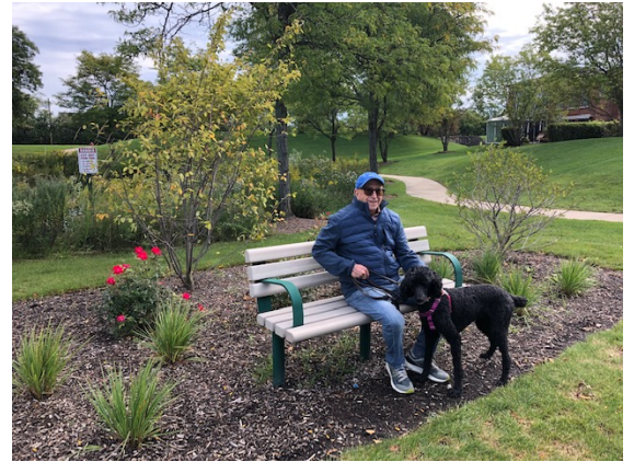
Townhome resident enjoys the newly landscaped Milford Rd. Park bench.

With the sound of a fountain in the background and a gorgeous park-like setting, who can resist spending a few quiet moments in the newly landscaped Milford Road bench area. Additional plans are in the works to further enhance this spot come next spring. Croquet anyone?